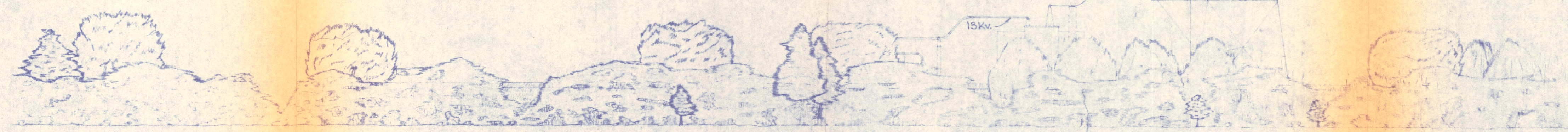
PLAN SCALE: 1/8" = 1.0'